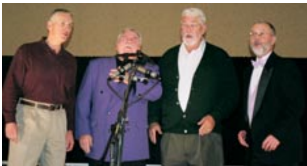
(Top and Middle) Chordiology wins the District Quartet Championship

Above: Resisting-A-Rest won the right to represent Pioneer at Mid-Winter Convention in the Seniors contest ( Antiques Roadshow will also go as a wild card. The new quartet scored high enough to have been on track to beat all quartets.