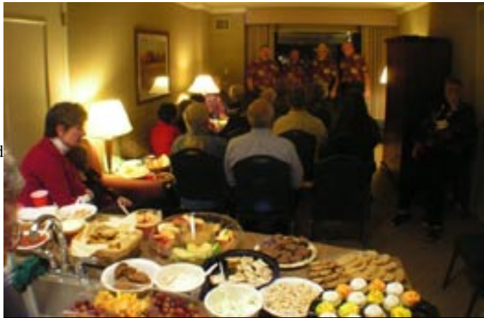
Hospitality: One of the best parts of convention.